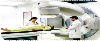
Magnetic Resonance Imaging Machine (MRI)