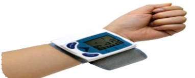
Blood Pressure Measuring Machine