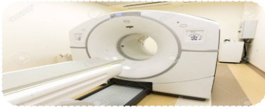
Computerized Axial Tomography Machine (CAT)