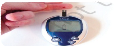
Blood Sugar Testing Machine