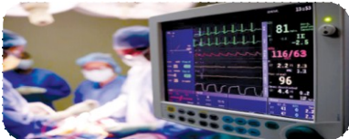
Cardiac Screening Machine