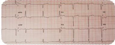
Electrocardiogram (ECG) Machine