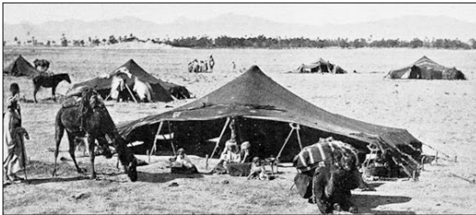
Bedouins and their tent

v).They consume milk and meat of animals & their skin for clothes & tent.