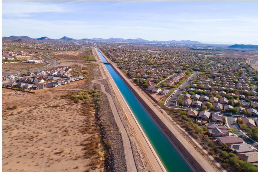
A desert canal

Q6. An oasis is a very important place in a desert why?